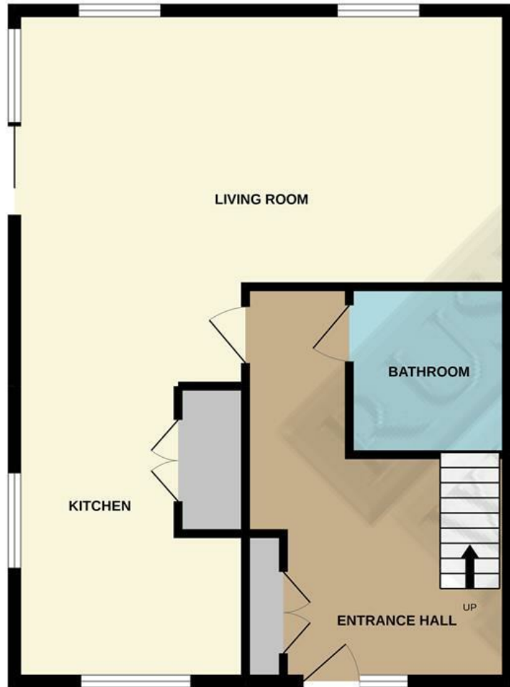
GROUND FLOOR 652 sq.ft. (60.6 sq.m.) approx.